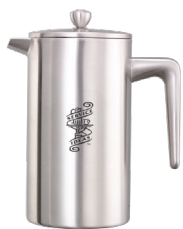
PDWSA800BS Stainless Press 0.8 Liter