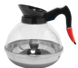
PCB18 Clear 1.8 Liter