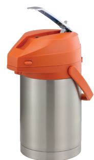
CTAL22OR Stainless Lined 2.2 Liter