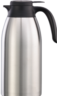
FCC20SS Brushed 2 Liter