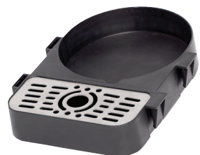
APDT1BL Brushed/Black Plastic