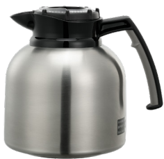
BNP19V4 Brushed 1.9 Liter