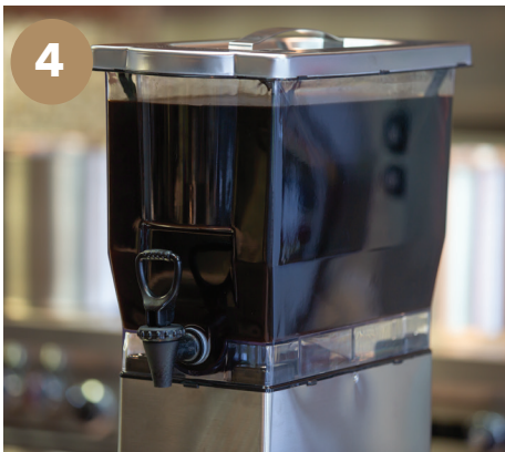
LET BREW 12-36 HOURS