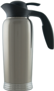
10-00744-000 Brushed 1 Liter