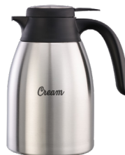
FCC12SS Stainless Carafe 1.2 Liter