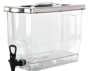
CBDTCONTKIT Tritan™ Plastic 3 Gallon