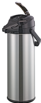
ENALG30S Glass Lined 3 Liter