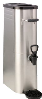
ITSLS3GPL Brushed Stainless 3 Gallon