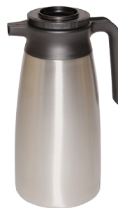
SHS19T Brushed 1.9 Liter