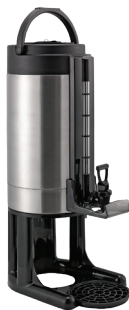
GIU2GV2 Brushed Original 2 Gallon