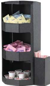
OCH7715C Black Plastic 4 Compartments