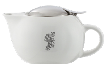
TPC10WH Ceramic Teapot 0.3 Liter