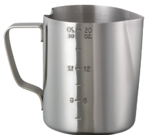
FROTH206 Brushed 20 oz.