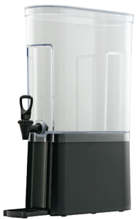
ITSLC35GBL Tritan™ Plastic 3.5 Gallon