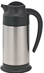
SSN70 Brushed 0.7 Liter