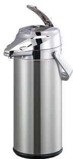
ENALS22SCH Stainless Lined 2.2 Liter