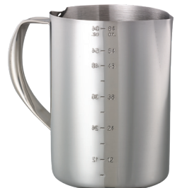
FROTH646 Brushed 64 oz.