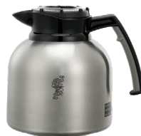
BNP19V4 Brew 'N' Pour® 1.9 Liter