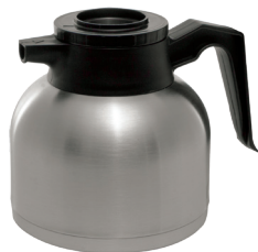
SHS19S Brushed 1.9 Liter