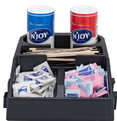
APC5 Black Plastic 5 Compartments