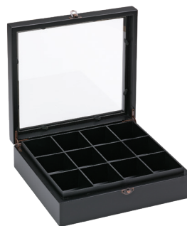
TB012 Black Wood 12 Compartments