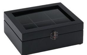
TB006 Black Wood 6 Compartments