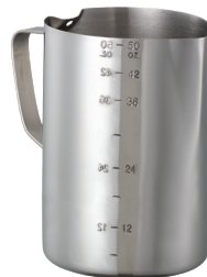
FROTH506 Brushed 50 oz.