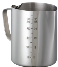
FROTH326 Brushed 32 oz.