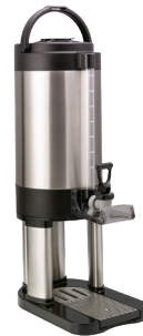
GIUSL15G Brushed Slim 1.5 Gallon