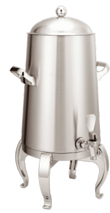
URN30VBSRG Brushed 3 Gallon