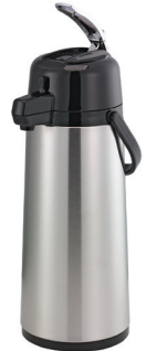
ECAL22S Glass Lined 2.2 Liter