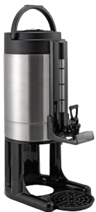
GIU15GV2 Brushed Original 1.5 Gallon