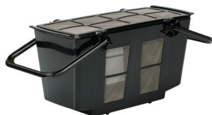
CBNS3BSKT Cold Brew Basket 3 lbs.