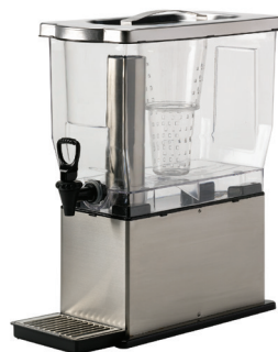
CBDT3SS Stainless 3 Gallon