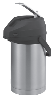
CTAL25BL Stainless Lined 2.5 Liter