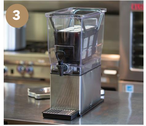
PLACE BASKET & FILL