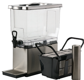
CBNS3SS Cold Brew System 3 Gallon