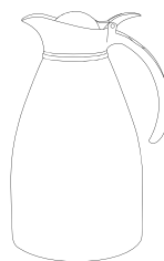
Placement A Facing Left